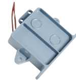
NEW BE9003 Electric field sensor switch suitable for use with 12V d.c. or 24 V d.c. pumps