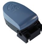
BE9002 Floatswitch suitable for use with 12 V d.c. or 24 V d.c. pumps

Whale high quality bilge accessories including electric bilge switches, non-return valves, elbows and Y pieces.